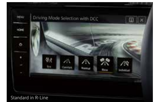
Standard in R-Line

LED projector headlights with LED Daytime Running Lights help illuminate your drive as well as highlight your sense of style.