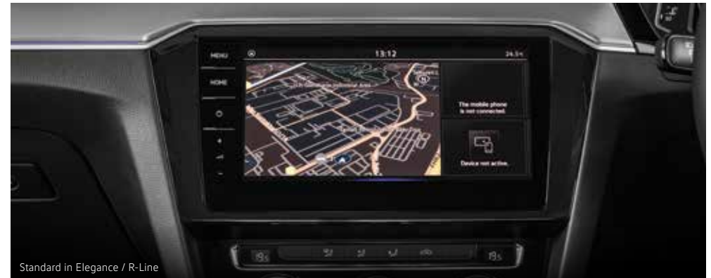
Standard in Elegance / R-Line