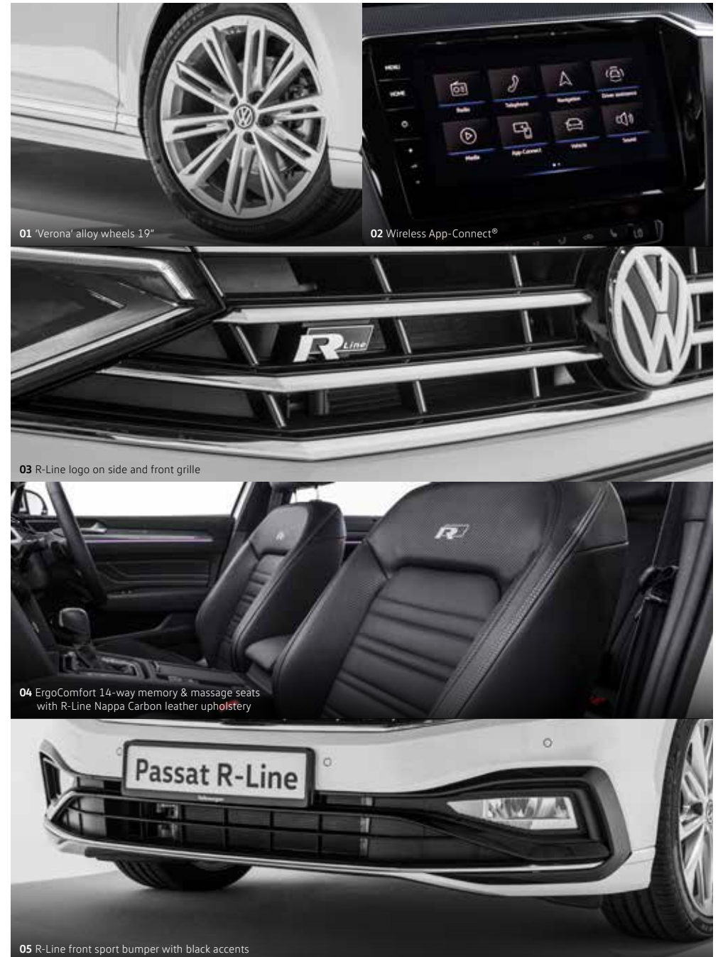
01 'Verona' alloy wheels 19"