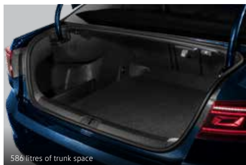
586 litres of trunk space