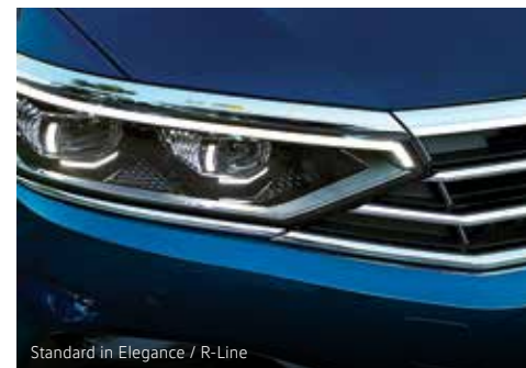
Standard in Elegance / R-Line

Whether it is to make a call while driving, look up current traffic information, pair up your phone using wireless App-Connect® or simply listen to your own music – the Passat is your hi-tech partner for the journey ahead.