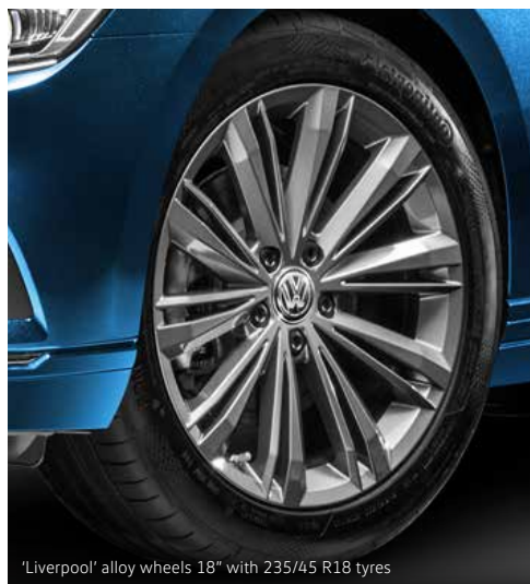
'Liverpool' alloy wheels 18" with 235/45 R18 tyres