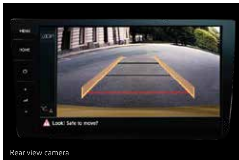
Rear view camera