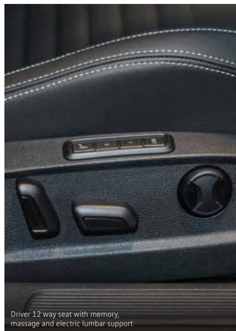
Driver 12 way seat with memory, massage and electric lumbar support