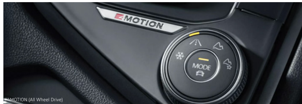
4MOTION (All Wheel Drive)

The Tiguan Allspace R-Line also offers a performance range 220PS engine packing 350Nm of torque, as well as a 4MOTION all-wheel-drive system. Our four-wheel drive system works hard to keep you safe by providing the best possible traction in all weather and road conditions.