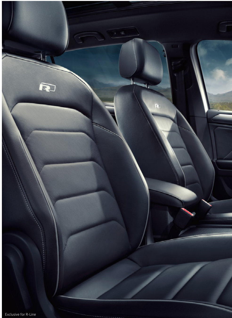
Exclusive for R-Line

Select your preferred driving mode from Comfort, Eco & Sport. The R-Line comes with Dynamic Chassis Control which helps you adjust your driving experience by modifying the suspension for each of the vehicle's wheels, plus an additional Off-Road Profile for better control and handling.