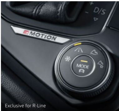
Exclusive for R-Line

When it comes to comfort and style, the Tiguan Allspace offers the best of both worlds. It comes equipped with 3-zone Climatronic air conditioning, 12-way driver electric seat adjustment with powered lumbar support and massage function. In the R-Line edition, the luxurious 'Vienna' leather seats with the characteristic 'R-Line' emblem on the backrests add an elegant touch while providing maximum support.