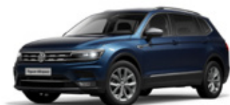
Tiguan Allspace Highline 1.4TSI