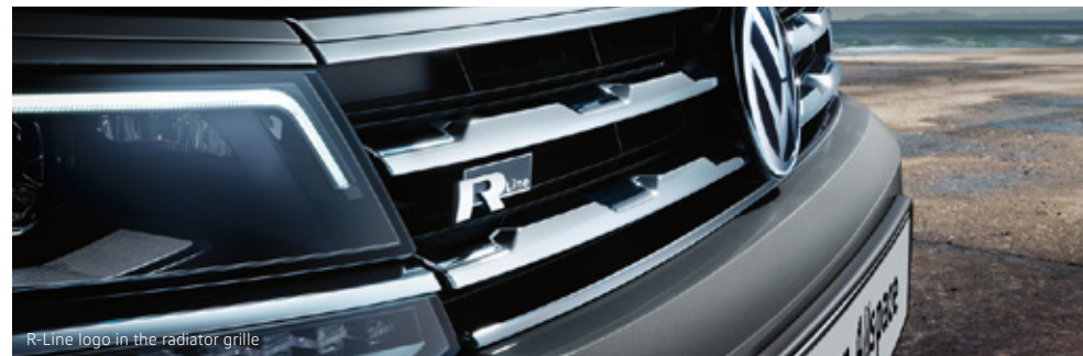
R-Line logo in the radiator grille