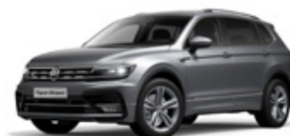
Tiguan Allspace R-Line 2.0TSI