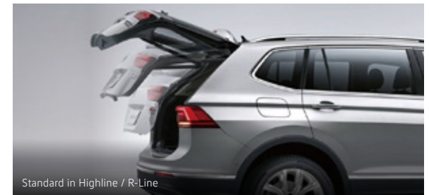
Standard in Highline / R-Line

The Tiguan Allspace comes with an electric tailgate system that opens and closes your tailgate simply with a press of a button.