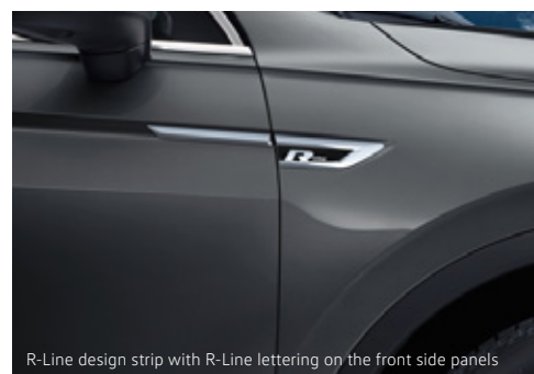
R-Line design strip with R-Line lettering on the front side panels