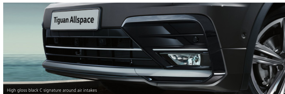
High gloss black C signature around air intakes