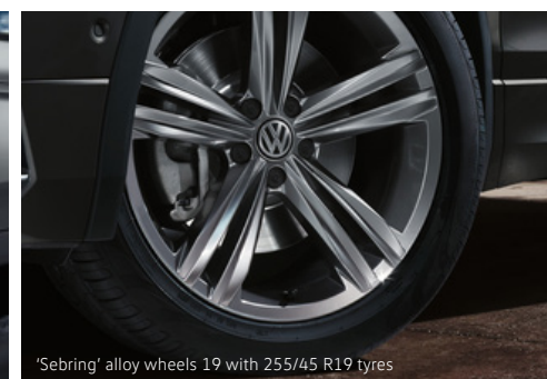
'Sebring' alloy wheels 19 with 255/45 R19 tyres